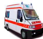
Emergency Doc 141