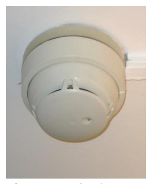
pic. 4.2: smoke detector

⇒ A false alarm must be paid for to Akademikerhilfe by the perpetrator; the amount to be paid will be decided by the fire brigade.