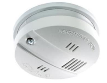
pic. 4.5: Domestic smoke alarm

Domestic smoke alarms give off a signal as soon as a certain concentration of smoke or vapour or a certain temperature are exceeded (e.g. cigarette smoke, water vapour etc.). A false alarm can be stopped by removing the source of the alarm and by airing the room. Complying with the general fire protection measures and regulations will help to avoid false alarms. No objects must be placed within a distance of at least 50 cm around the warning device.