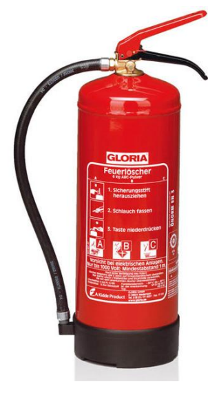
pic. 4.3: fire extinguisher