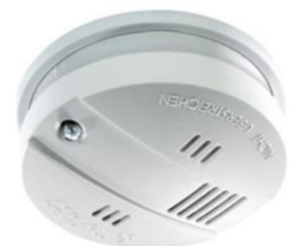
pic. 4.3: Domestic smoke alarm

Domestic smoke alarms give off a signal as soon as a certain concentration of smoke or vapour or a certain temperature are exceeded (e.g. cigarette smoke, water vapour etc.). A false alarm can be stopped by removing the source of the alarm and by airing the room. Complying with the general fire protection measures and regulations will help to avoid false alarms. No objects must be placed within a distance of at least 50 cm around the warning device.