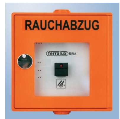
pic. 4.2: smoke vent button

Pushing the smoke vent button does not cause an automatic alarm message to the fire brigade like the fire alarm button. Therefore, in case of emergency, additionally push the fire alarm button and alert the fire brigade via telephone.