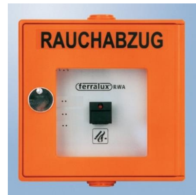
pic. 4.2: smoke vent button

Pushing the smoke vent button does not cause an automatic alarm message to the fire brigade like the fire alarm button. Therefore, in case of emergency, additionally push the fire alarm button and alert the fire brigade via telephone.