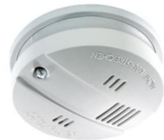
pic. 4.3: Domestic smoke alarm

⇒ Domestic smoke alarms must not be tampered with. Any damage done to the device by defying this order will be repaired at the expense of the person responsible for the damage.