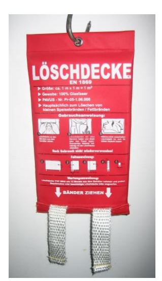
pic. 4.3: fire blanket