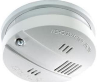
pic. 4.7: Domestic smoke alarm

Domestic smoke alarms give off a signal as soon as a certain concentration of smoke or vapour or a certain temperature are exceeded (e.g. cigarette smoke, water vapour etc.). A false alarm can be stopped by removing the source of the alarm and by airing the room. Complying with the general fire protection measures and regulations will help to avoid false alarms. No objects must be placed within a distance of at least 50 cm around the warning device.