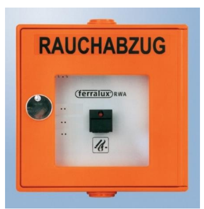
pic. 4.2: smoke vent button

Pushing the smoke vent button does not cause an automatic alarm message to the fire brigade like the fire alarm button. Therefore, in case of emergency, additionally push the fire alarm button and alert the fire brigade via telephone.