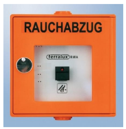
pic. 4.5: smoke vent button

Pushing the smoke vent button does not cause an automatic alarm message to the fire brigade like the fire alarm button. Therefore, in case of emergency, additionally push the fire alarm button and alert the fire brigade via telephone.