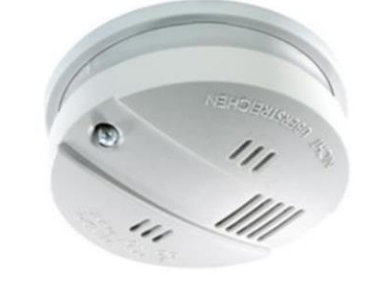
pic. 4.7: Domestic smoke alarm

Domestic smoke alarms give off a signal as soon as a certain concentration of smoke or vapour or a certain temperature are exceeded (e.g. cigarette smoke, water vapour etc.). A false alarm can be stopped by removing the source of the alarm and by airing the room. Complying with the general fire protection measures and regulations will help to avoid false alarms. No objects must be placed within a distance of at least 50 cm around the warning device.