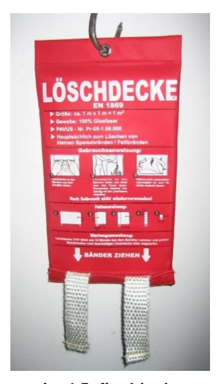
pic. 4.5: fire blanket