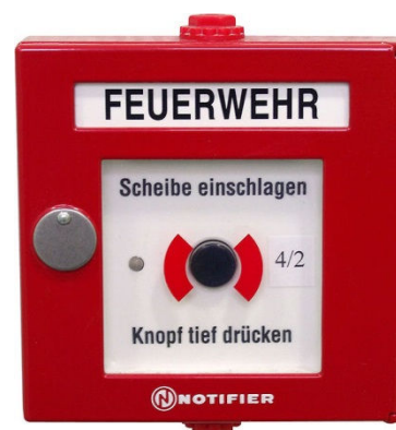
Pic. 4.1: fire alarm button