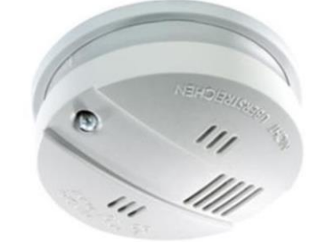
pic. 4.3: Domestic smoke alarm

Domestic smoke alarms give off a signal as soon as a certain concentration of smoke or vapour or a certain temperature are exceeded (e.g. cigarette smoke, water vapour etc.). A false alarm can be stopped by removing the source of the alarm and by airing the room. Complying with the general fire protection measures and regulations will help to avoid false alarms. No objects must be placed within a distance of at least 50 cm around the warning device.