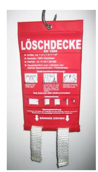
pic. 4.2: fire blanket