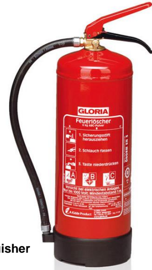
pic. 4.1: fire extinguisher