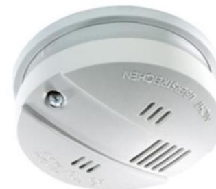
pic. 4.3: Domestic smoke alarm

Domestic smoke alarms give off a signal as soon as a certain concentration of smoke or vapour or a certain temperature are exceeded (e.g. cigarette smoke, water vapour etc.). A false alarm can be stopped by removing the source of the alarm and by airing the room. Complying with the general fire protection measures and regulations will help to avoid false alarms. No objects must be placed within a distance of at least 50 cm around the warning device.