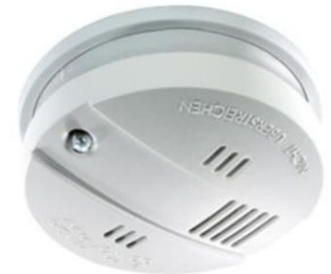
pic. 4.7: Domestic smoke alarm

⇒ Domestic smoke alarms must not be tampered with. Any damage done to the device by defying this order will be repaired at the expense of the person responsible for the damage.