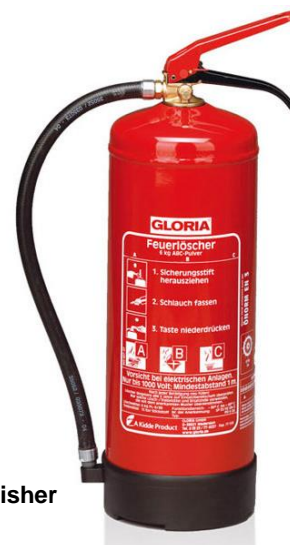
pic. 4.1: fire extinguisher