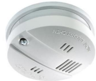
pic. 4.7: Domestic smoke alarm

Domestic smoke alarms give off a signal as soon as a certain concentration of smoke or vapour or a certain temperature are exceeded (e.g. cigarette smoke, water vapour etc.). A false alarm can be stopped by removing the source of the alarm and by airing the room. Complying with the general fire protection measures and regulations will help to avoid false alarms. No objects must be placed within a distance of at least 50 cm around the warning device.