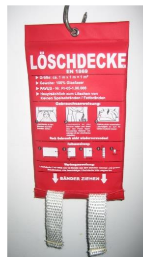
pic. 4.3: fire blanket