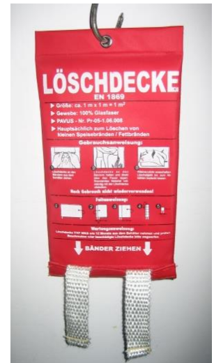
pic. 4.5: fire blanket