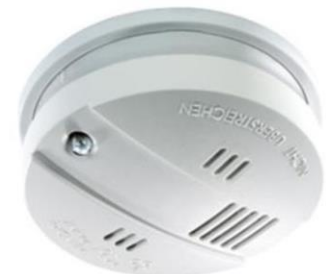
pic. 4.6: Domestic smoke alarm

Domestic smoke alarms give off a signal as soon as a certain concentration of smoke or vapour or a certain temperature are exceeded (e.g. cigarette smoke, water vapour etc.). A false alarm can be stopped by removing the source of the alarm and by airing the room. Complying with the general fire protection measures and regulations will help to avoid false alarms. No objects must be placed within a distance of at least 50 cm around the warning device.