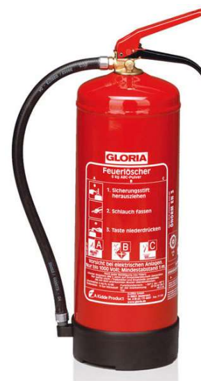
pic. 4.3: fire extinguisher