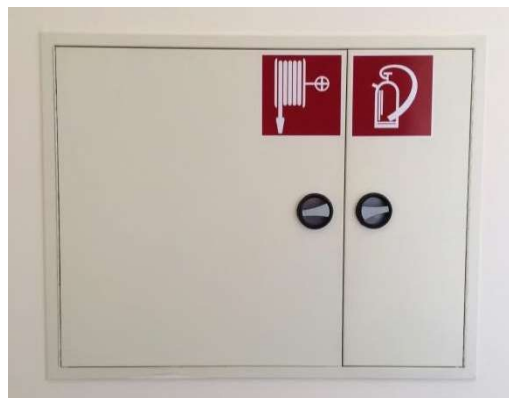
pic. 4.4.1: wall hydrant cabinet (here together with extinguisher)

Wall hydrants are water supply points installed in wall cabinets for the purpose of fire fighting. Familiarize yourself with their proper handling and location. They are not only provided for the fire brigade, but similar to a fire extinguisher accessible to anyone to fight a fire in the incipient stage.