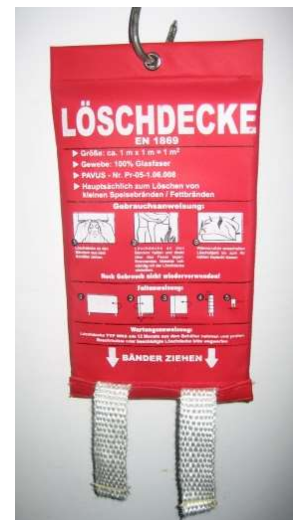
pic. 4.5: fire blanket