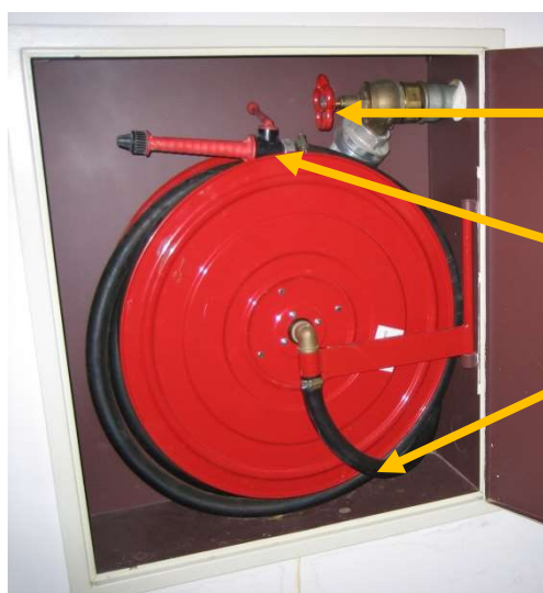
pic.4.4.2: opened wall hydrant cabinet