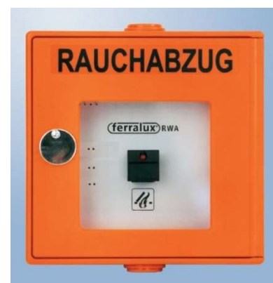
pic. 4.6: smoke vent button

Pushing the smoke vent button does not cause an automatic alarm message to the fire brigade like the fire alarm button. Therefore, in case of emergency, additionally push the fire alarm button and alert the fire brigade via telephone.