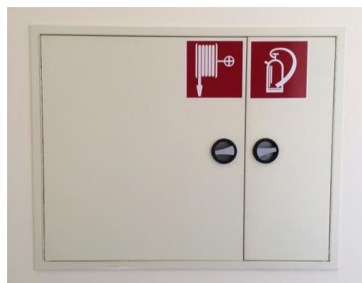
pic. 4.4.1: wall hydrant cabinet (here together with extinguisher)

Wall hydrants are water supply points installed in wall cabinets for the purpose of fire fighting. Familiarize yourself with their proper handling and location. They are not only provided for the fire brigade, but similar to a fire extinguisher accessible to anyone to fight a fire in the incipient stage.