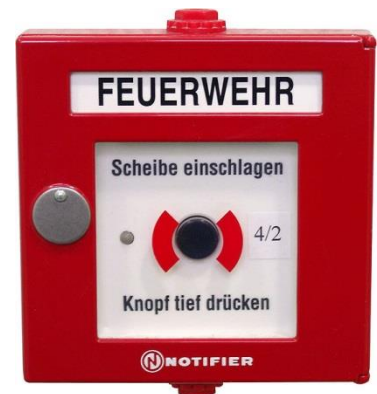
Pic. 4.1: fire alarm button

These buttons trigger the fire alarm. Pushing the button not only raises an alarm (siren) in the house, but also alerts the fire brigade directly and immediately. Every resident is required to memorize the location of the nearest fire alarm button and to activate it when a fire is detected.