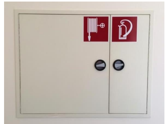
pic. 4.4.1: wall hydrant cabinet (here together with extinguisher)

Wall hydrants are water supply points installed in wall cabinets for the purpose of fire fighting. Familiarize yourself with their proper handling and location. They are not only provided for the fire brigade, but similar to a fire extinguisher accessible to anyone to fight a fire in the incipient stage.