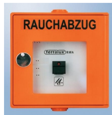
pic. 4.5: smoke vent button

Pushing the smoke vent button does not cause an automatic alarm message to the fire brigade like the fire alarm button. Therefore, in case of emergency, additionally push the fire alarm button and alert the fire brigade via telephone.