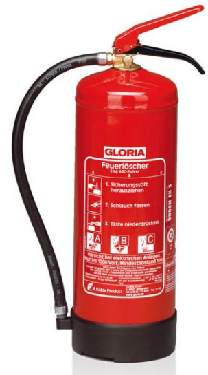
pic. 4.1: fire extinguisher