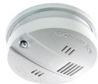
pic. 4.2: Domestic smoke alarm

Domestic smoke alarms give off a signal as soon as a certain concentration of smoke or vapour or a certain temperature are exceeded (e.g. cigarette smoke, water vapour etc.). A false alarm can be stopped by removing the source of the alarm and by airing the room. Complying with the general fire protection measures and regulations will help to avoid false alarms. No objects must be placed within a distance of at least 50 cm around the warning device.