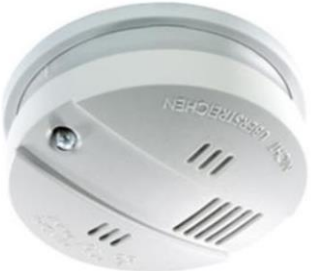
pic. 4.2: Domestic smoke alarm

Domestic smoke alarms give off a signal as soon as a certain concentration of smoke or vapour or a certain temperature are exceeded (e.g. cigarette smoke, water vapour etc.). A false alarm can be stopped by removing the source of the alarm and by airing the room. Complying with the general fire protection measures and regulations will help to avoid false alarms. No objects must be placed within a distance of at least 50 cm around the warning device.