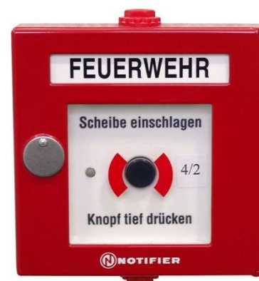
Pic. 4.1: fire alarm button

These buttons trigger the fire alarm. Pushing the button not only raises an alarm (siren) in the house, but also alerts the fire brigade directly and immediately. Every resident is required to memorize the location of the nearest fire alarm button and to activate it when a fire is detected.