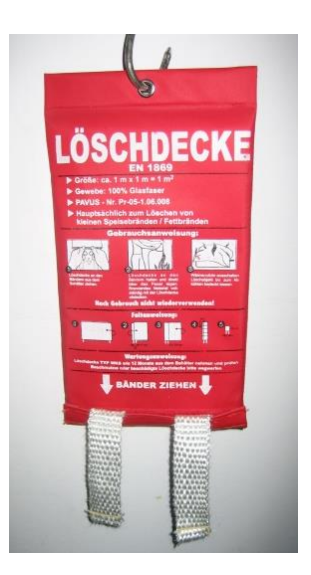
pic. 4.3: fire blanket