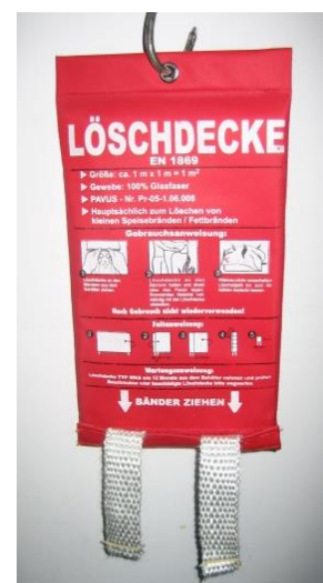
pic. 4.3: fire blanket