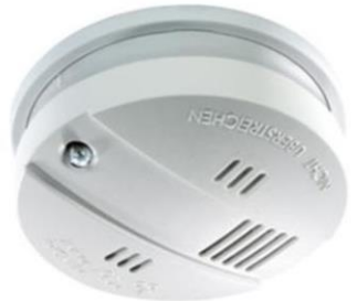
pic. 4.3: Domestic smoke alarm

Domestic smoke alarms give off a signal as soon as a certain concentration of smoke or vapour or a certain temperature are exceeded (e.g. cigarette smoke, water vapour etc.). A false alarm can be stopped by removing the source of the alarm and by airing the room. Complying with the general fire protection measures and regulations will help to avoid false alarms. No objects must be placed within a distance of at least 50 cm around the warning