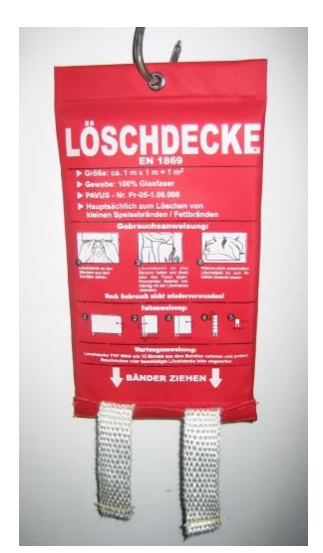
pic. 4.2: fire blanket