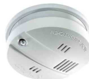
pic. 4.3: Domestic smoke alarm

Domestic smoke alarms give off a signal as soon as a certain concentration of smoke or vapour or a certain temperature are exceeded (e.g. cigarette smoke, water vapour etc.). A false alarm can be stopped by removing the source of the alarm and by airing the room. Complying with the general fire protection measures and regulations will help to avoid false alarms. No objects must be placed within a distance of at least 50 cm around the warning device.