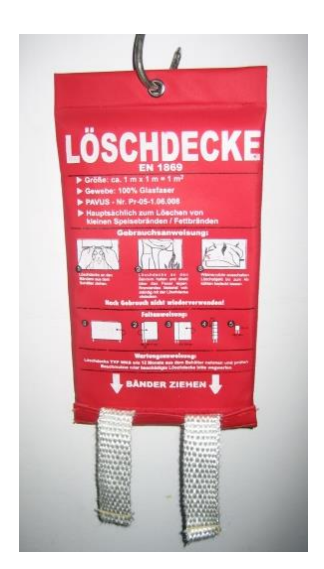
pic. 4.6: fire blanket