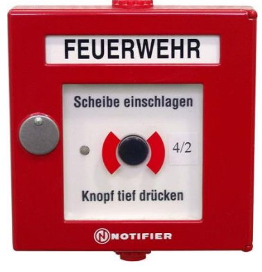
Pic. 4.1: fire alarm button

not only raises an alarm (siren) in the house, but also alerts the fire brigade directly and immediately. Every resident is required to memorize the location of the nearest fire alarm button and to activate it when a fire is detected.