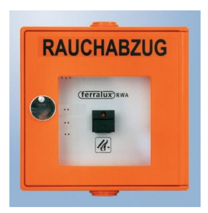
pic. 4.5: smoke vent button

Pushing the smoke vent button does not cause an automatic alarm message to the fire brigade like the fire alarm button. Therefore, in case of emergency, additionally push the fire alarm button and alert the fire brigade via telephone.