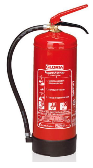
pic. 4.3: fire extinguisher