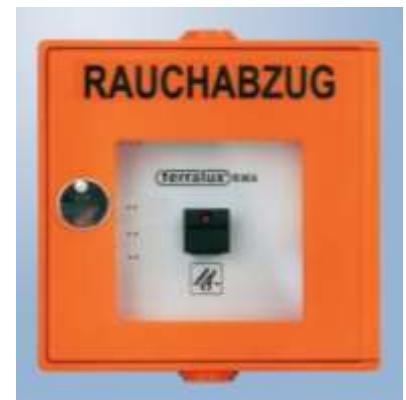
pic. 4.4: smoke vent button

Pushing the smoke vent button does not cause an automatic alarm message to the fire brigade like the fire alarm button. Therefore, in case of emergency, additionally push the fire alarm button and alert the fire brigade via telephone.