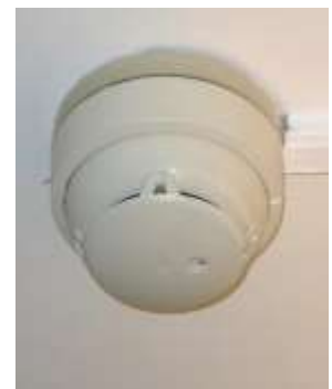
pic. 4.2: smoke detector