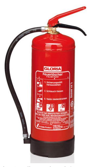
pic. 4.3: fire extinguisher