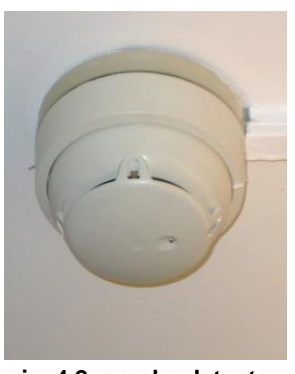
pic. 4.2: smoke detector

⇒ A false alarm must be paid for to Akademikerhilfe by the perpetrator; the amount to be paid will be decided by the fire brigade.