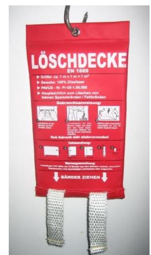
pic. 4.3: fire blanket