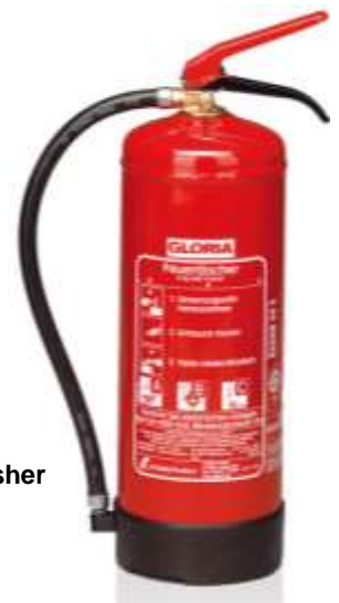
pic. 4.2: fire extinguisher