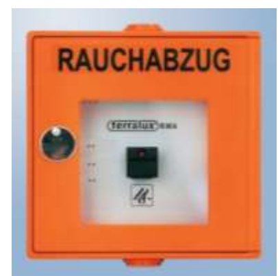
pic. 4.3: smoke vent button

Pushing the smoke vent button does not cause an automatic alarm message to the fire brigade like the fire alarm button. Therefore, in case of emergency, additionally push the fire alarm button and alert the fire brigade via telephone.