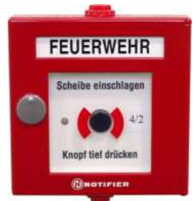
Pic. 4.1: fire alarm button

These buttons trigger the fire alarm. Pushing the button only raises an alarm (siren) in the house, but does not alert the fire brigade directly and immediately. Every resident is required to memorize the location of the nearest fire alarm button and to activate it when a fire is detected.