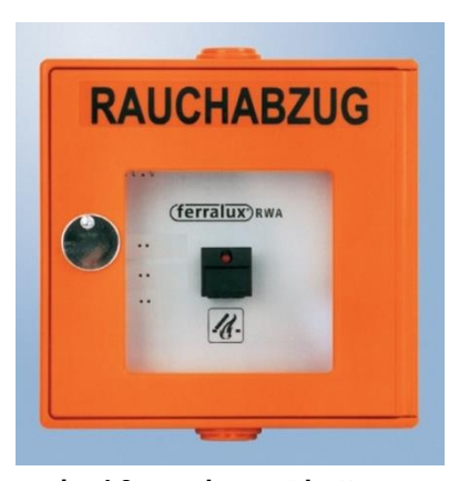
pic. 4.3: smoke vent button

Pushing the smoke vent button does not cause an automatic alarm message to the fire brigade like the fire alarm button. Therefore, in case of emergency, additionally push the fire alarm button and alert the fire brigade via telephone.