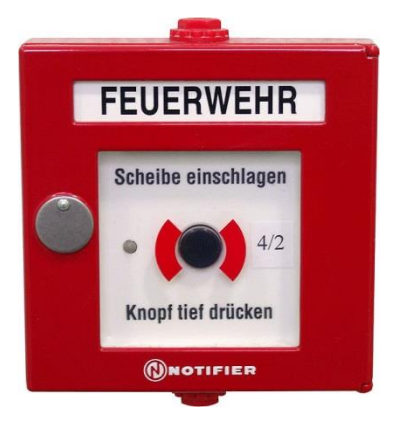
Pic. 4.1: fire alarm button

⇒ A false alarm must be paid for to Akademikerhilfe by the perpetrator; the amount to be paid will be decided by the fire brigade.