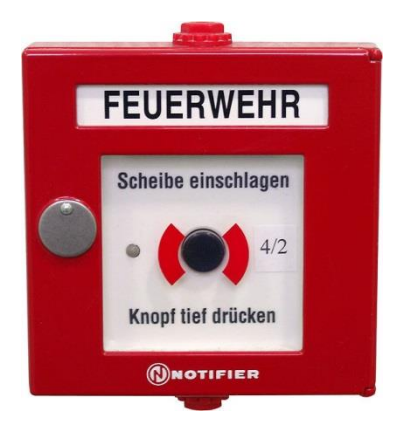
Pic. 4.1: fire alarm button