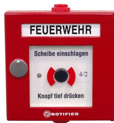
Pic. 4.1: fire alarm button

These buttons trigger the fire alarm. Pushing the button only raises an alarm (siren) in the house, but does not alert the fire brigade directly and immediately. Every resident is required to memorize the location of the nearest fire alarm button and to activate it when a fire is detected.