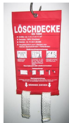
pic. 4.3: fire blanket