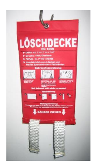
pic. 4.5: fire blanket