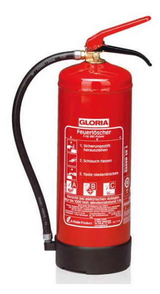
pic. 4.3: fire extinguisher