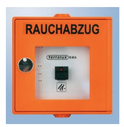
pic. 4.4: smoke vent button

Pushing the smoke vent button does not cause an automatic alarm message to the fire brigade like the fire alarm button. Therefore, in case of emergency, additionally push the fire alarm button and alert the fire brigade via telephone.