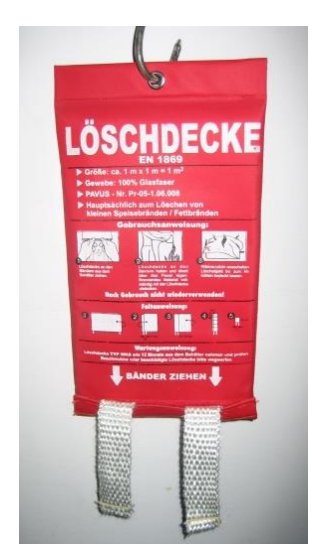
pic. 4.5: fire blanket