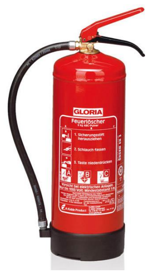
pic. 4.3: fire extinguisher