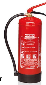
pic. 4.3: fire extinguisher