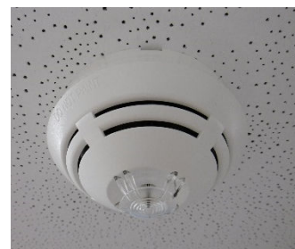
pic. 4.2: smoke detector