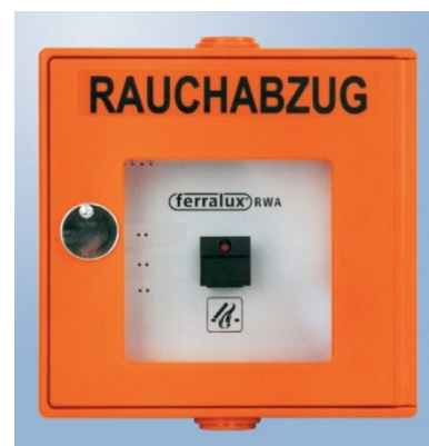
pic. 4.4: smoke vent button

Pushing the smoke vent button does not cause an automatic alarm message to the fire brigade like the fire alarm button. Therefore, in case of emergency, additionally push the fire alarm button and alert the fire brigade via telephone.