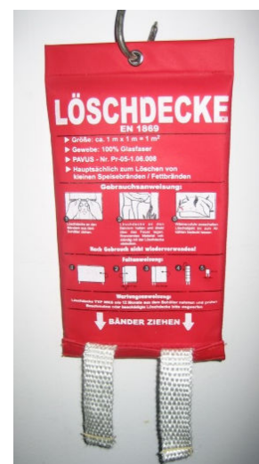
pic. 4.5: fire blanket