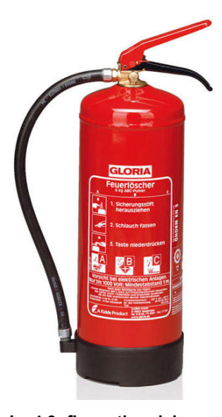
pic. 4.3: fire extinguisher