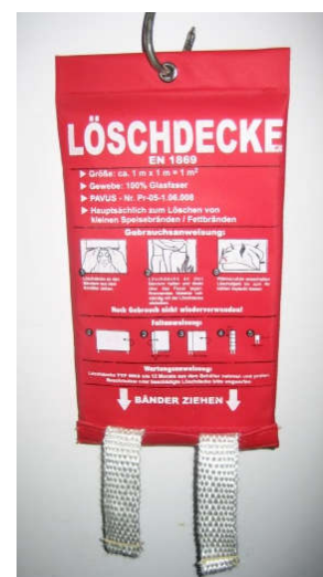
pic. 4.5: fire blanket