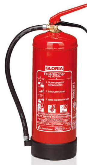
pic. 4.3: fire extinguisher