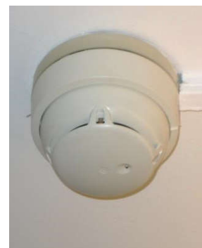
pic. 4.2: smoke detector