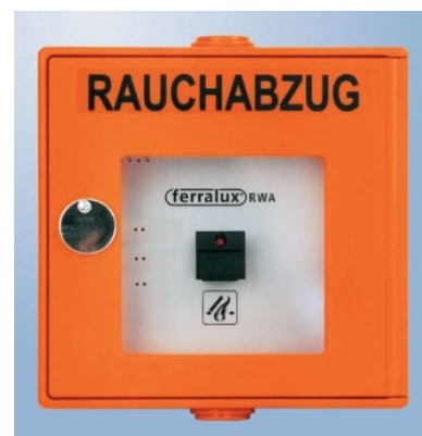
pic. 4.4: smoke vent button

Pushing the smoke vent button does not cause an automatic alarm message to the fire brigade like the fire alarm button. Therefore, in case of emergency, additionally push the fire alarm button and alert the fire brigade via telephone.