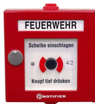
Pic. 4.1: fire alarm button