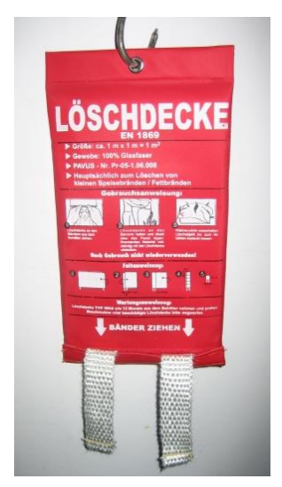
pic. 4.6: fire blanket