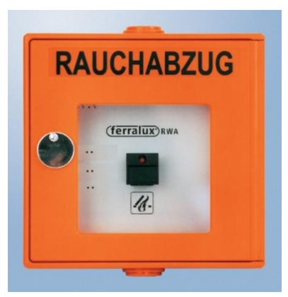
pic. 4.5: smoke vent button

Pushing the smoke vent button does not cause an automatic alarm message to the fire brigade like the fire alarm button. Therefore, in case of emergency, additionally push the fire alarm button and alert the fire brigade via telephone.