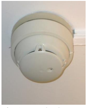
pic. 4.2: smoke detector

A false alarm must be paid for to Akademikerhilfe by the perpetrator; the amount to be paid will be decided by the fire brigade.