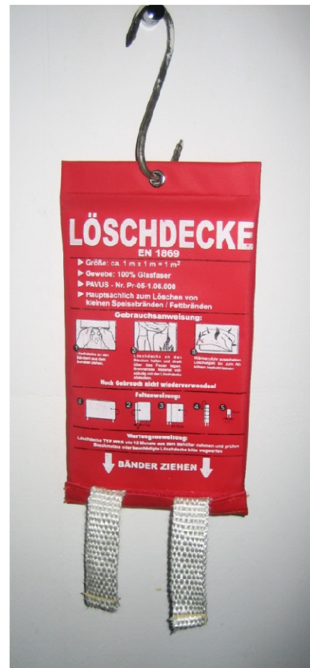
Pict. 6: Fire Blanket