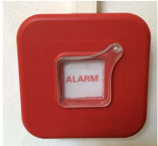
Pict. 1: Fire Alarm Button

In the entire building Fire Alarm Buttons are fixed close to the exit doors, the emergency exits and the access to the stairs (red boxes—see Pict.1). Pushing this button activates an alarm (siren) within the building which is not, however, passed on to the fire brigade or any other emergency organisation. In an emergency you only alarm the other residents with this siren. In addition you must call the fire brigade Every resident is obliged to remember the location of the nearest Fire