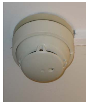
Pict. 2: Automatic Smoke Detector (icon)

The entire building, part of the building or fire compartment is fitted with Automatic Smoke Detectors on the ceilings (see Pict.2). These detectors trigger off an alarm if a certain concentration of smoke or vapour/steam or a certain temperature is exceeded. The alarm (siren) within the building which is not, however, passed on to the fire brigade or any other emergency organisation. In order to avoid false alarms please observe the general measures to prevent fire. A radius of at least 50 centimetres must be kept free from objects around the detector at all times.