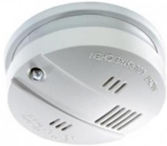
Pict. 3: Icon image of smoke detector ( www.rauchmeldershop.at ). Download on 14/02/2013

PLEASE NOTE! This smoke detector does not send an alarm to the fire brigade. In case of fire the fire brigade must be alarmed by telephone or use the fire alarm button.