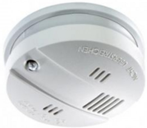
Pict. 2: Icon image of smoke detector (www.rauchmeldershop.at). Download on 14/02/2013

PLEASE NOTE! This smoke detector does not send an alarm to the fire brigade. In case of fire the fire brigade must be alarmed by telephone.