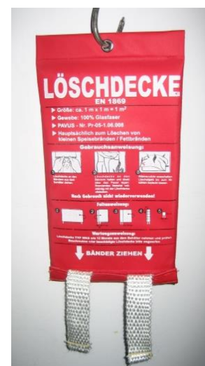
pic. 4.3: fire blanket