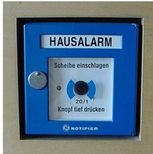
Pict. 4: House Alarm Button

The House Alarm is located on the ground floor close to the exit (see Pict.4). Please remember its location. Pushing this button activates an alarm (siren) within the building which is not, however, passed on to the fire brigade or any other emergency organisation. In an emergency you only alarm the other residents with this siren. In addition you must call the fire brigade or a competent emergency organisation.