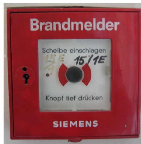
Pict. 1: Fire Alarm Button

In the entire building Fire Alarm Buttons are fixed close to the exit doors, the emergency exits and the access to the stairs (red boxes “Brandmelder” – see Pict.1). The black button is protected by a glass pane, which must be broken in case of fire. Pressing the button both releases the alarm of a siren in the building and sends a direct signal to the fire brigade at once. Every resident is obliged to remember the location of the nearest Fire Alarm Button and to activate it at once in the event of fire.