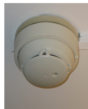
Pict. 2: Automatic Smoke Detector

The entire building, part of the building or fire compartment is fitted with Automatic Smoke Detectors on the ceilings (see Pict.2). These detectors trigger off an alarm if a certain concentration of smoke or vapour/steam or a certain temperature is exceeded. In order to avoid false alarms please observe the general measures to prevent fire. A radius of at least 50 centimetres must be kept free from objects around the detector at all times.