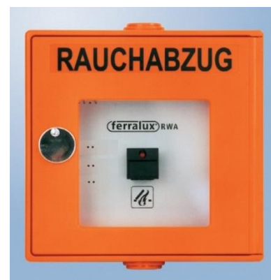
pic. 4.5: smoke vent button

Pushing the smoke vent button does not cause an automatic alarm message to the fire brigade like the fire alarm button. Therefore, in case of emergency, additionally push the fire alarm button and alert the fire brigade via telephone.