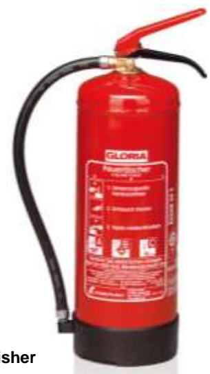
pic. 4.1: fire extinguisher