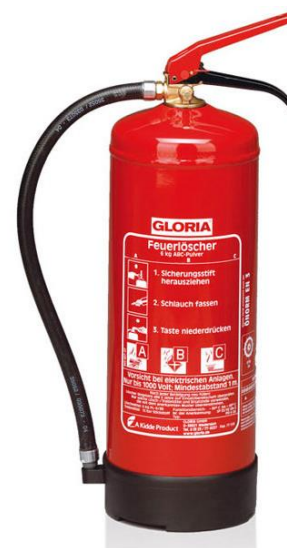
pic. 4.3: fire extinguisher