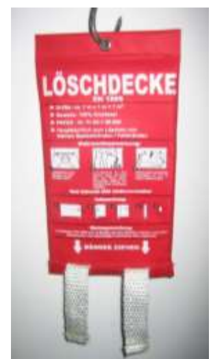
pic. 4.3: fire blanket