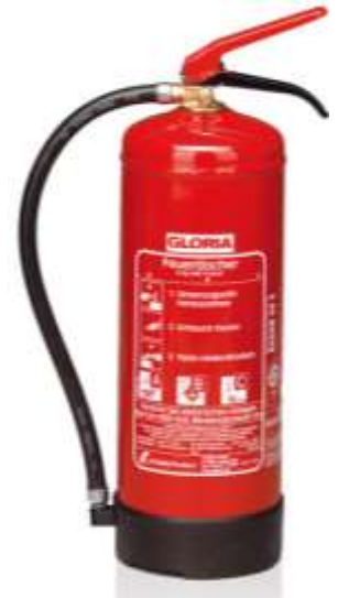
pic. 4.1: fire extinguisher