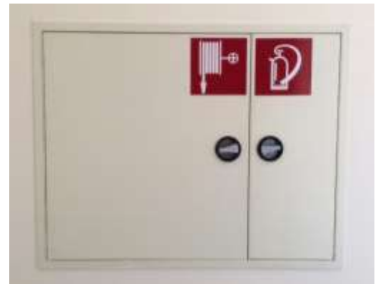
pic. 4.4.1: wall hydrant cabinet (here together with extinguisher)

Wall hydrants are water supply points installed in wall cabinets for the purpose of fire fighting. Familiarize yourself with their proper handling and location. They are not only provided for the fire brigade, but similar to a fire extinguisher accessible to anyone to fight a fire in the incipient stage.